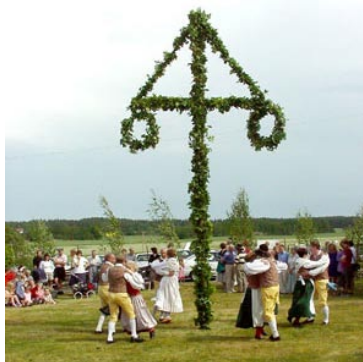
Dancing around the midsummer pole